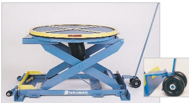
Semi-live portability for moving unloaded lift features two wheels and a dolly handle. Inset is close-up of dolly wheel unit.