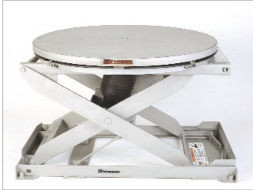
EZ Loader constructed of 304 stainless steel for food and washdown applications.