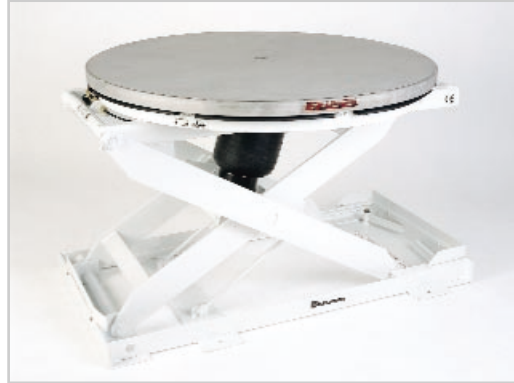
EZ Loader with wash-down package consisting of USDA accepted paint and stainless steel rotating platform.