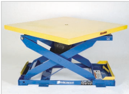
Bishamon EZ Loader with solid rectangular rotating top.