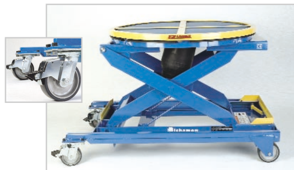
Caster portability cart features two fixed and two swivel casters with brakes. Inset is close-up of swivel casters.