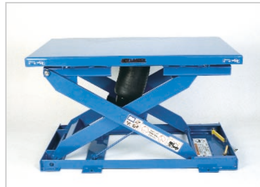
Bishamon EZ Loader with rectangular narrow non-rotating top.