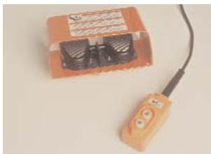
Heavy-duty, NEMA 12 hand control for safe, convenient lift operation - Shown with optional foot control