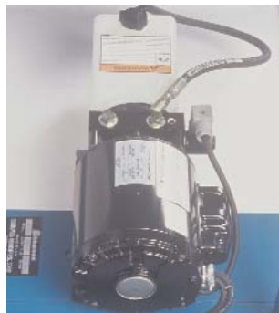
New 115 volt unitized power unit eliminates previous duty cycle restrictions