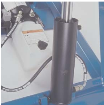
New single acting cylinder with flow limiting valve provides safe gravity-down operation