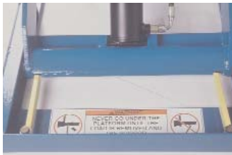
Hinged maintenance catches for convenience and added safety